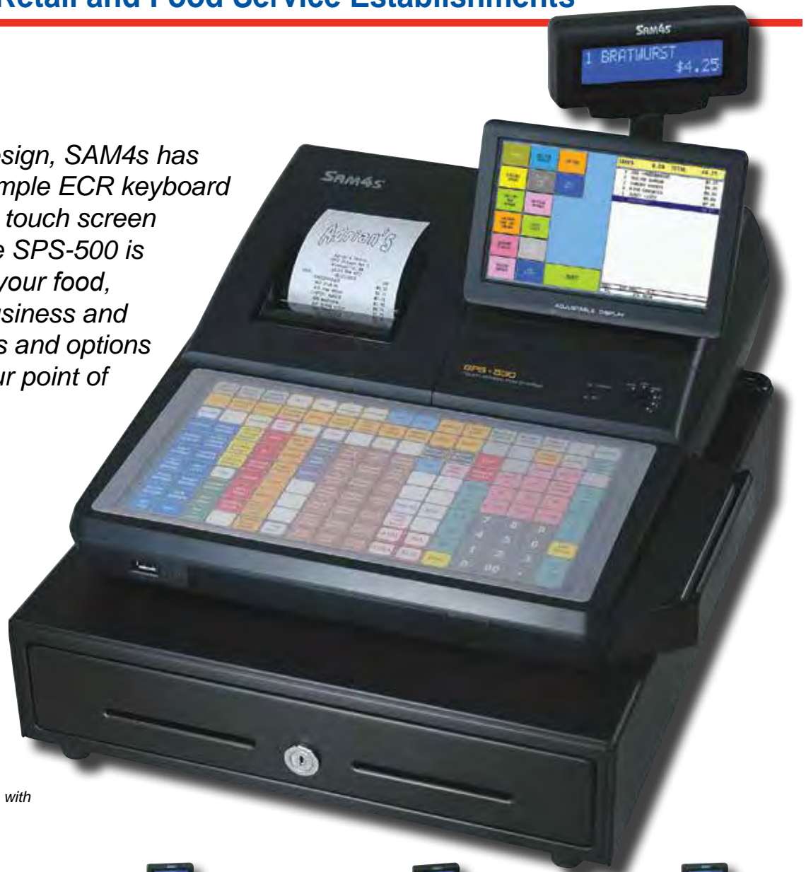
SPS-500 Series Hybrid ECRs Shown with Optional Card Reader

Featuring a hybrid design, SAM4s has combined fast and simple ECR keyboard entry with an intuitive touch screen operator display. The SPS-500 is easily configured for your food, beverage, or retail business and provides the functions and options you need to meet your point of service needs.