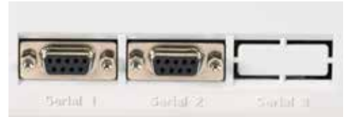
Two Standard RS-232C Ports