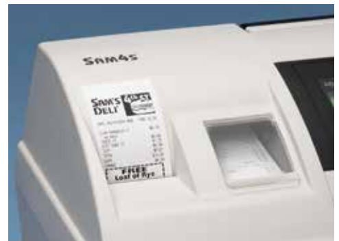
Quick and Easy Drop-in Paper Loading