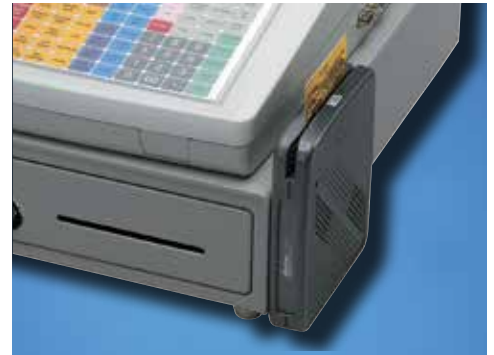
DataTran™ Integrated Credit Option